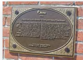
Designated Heritage Plaque was installed in early spring 2018

Sadly, OCA was not notified as to the date of installation. I have been in touch with the Vinci School administration which now operates its private school in the former Overbrook Public School and have discussed various ways to celebrate its heritage.