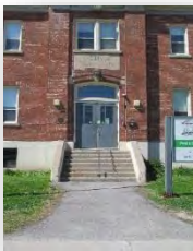
Overbrook Public School 1917 - 2002